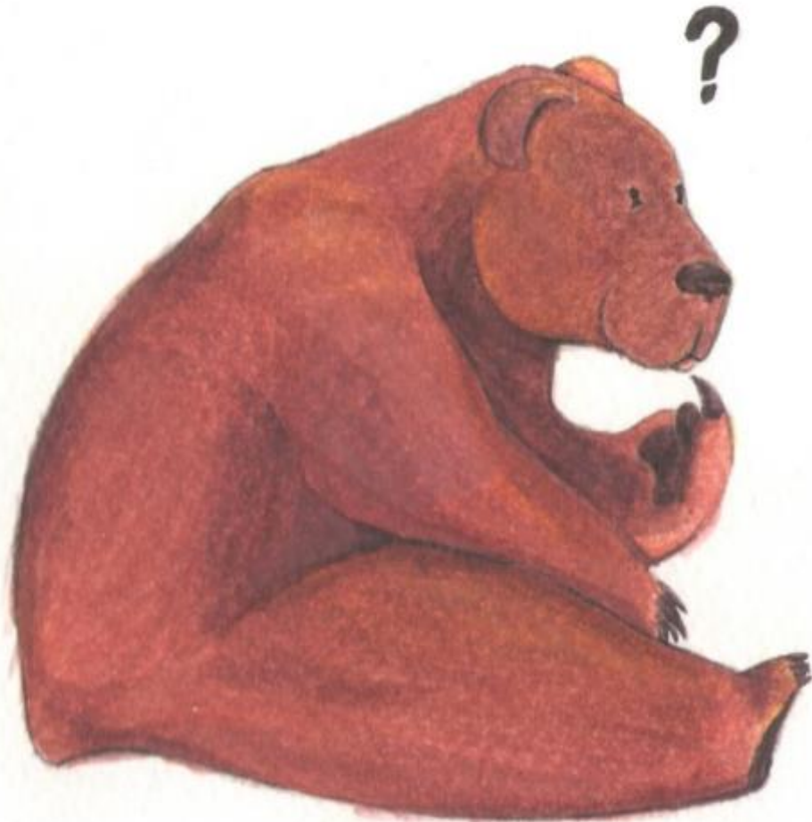
Drawing M. Panichi