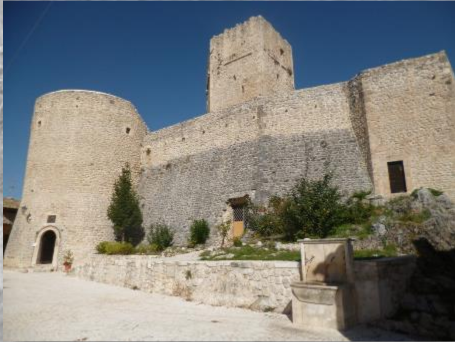
Pettorano sul Gizio, Monte Genzana Alto Gizio Nature Reserve