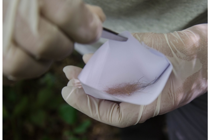
Collection of signs of presence.