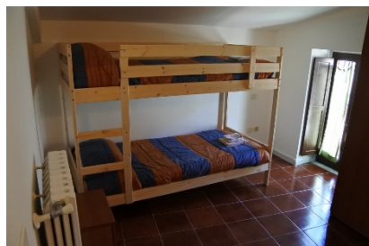
Guesthouse in Rua Frisciotta 2, 67034, Pettorano sul Gizio (AQ), Italy.