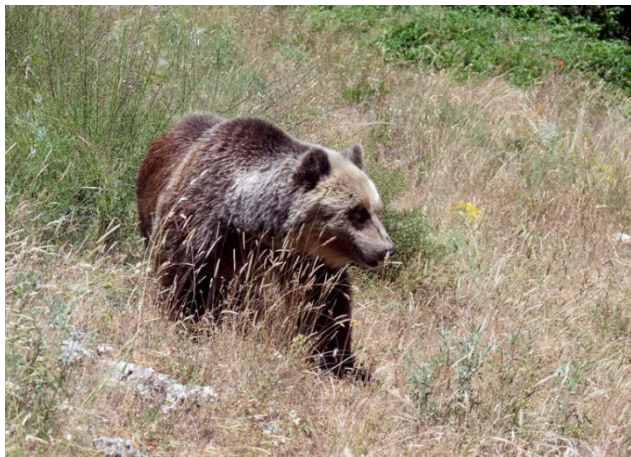
Marsican brown bear.