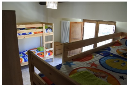
Guesthouse "Pajare" in via Scalelle snc, 67034, Pettorano sul Gizio (AQ), Italy.