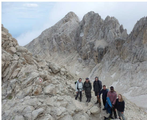
Gran Sasso National Park.