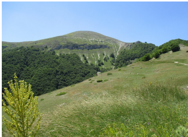
A view of Monte Genzana Nature Reserve.