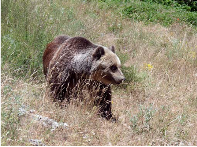
Marsican brown bear.