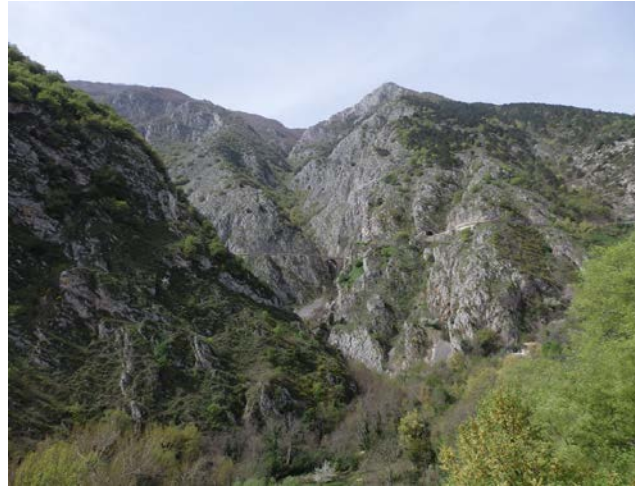
A view of Gole del Sagittario Nature Reserve.