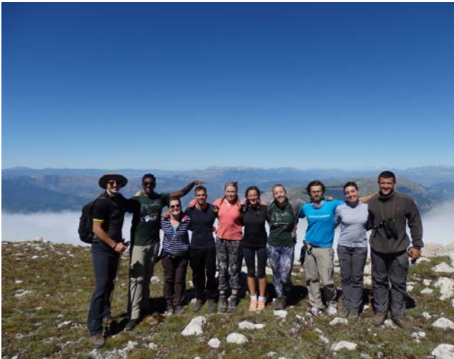
Majella National Park.