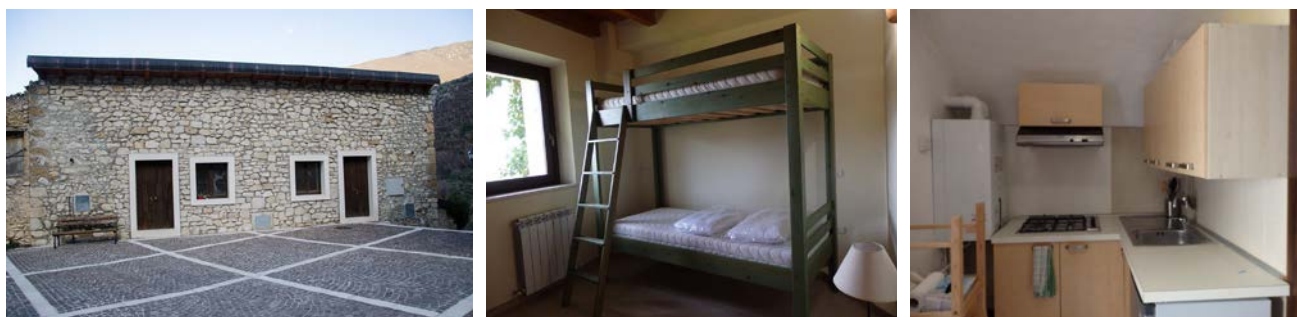
Guesthouses in Aia delle Piagge, via Piagge snc, 67030, Anversa degli Abruzzi (AQ), Italy.

The Commune and the Gole del Sagittario Nature Reserve will provide our volunteers with comfortable accommodation in Anversa degli Abruzzi.