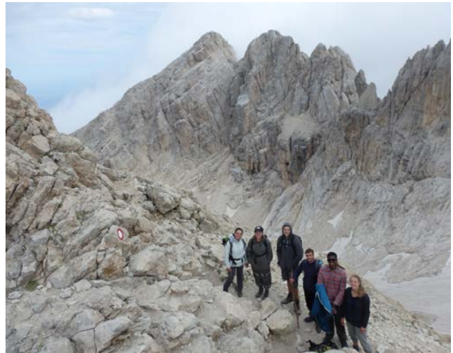
Gran Sasso National Park.