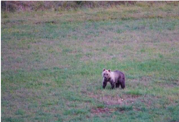
Marsican brown bear