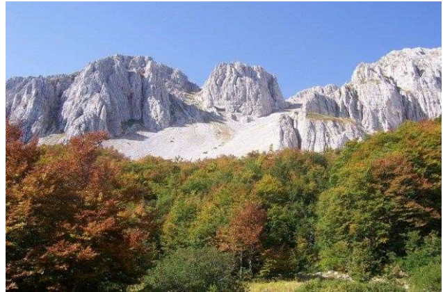
Sirente Velino Regional Park