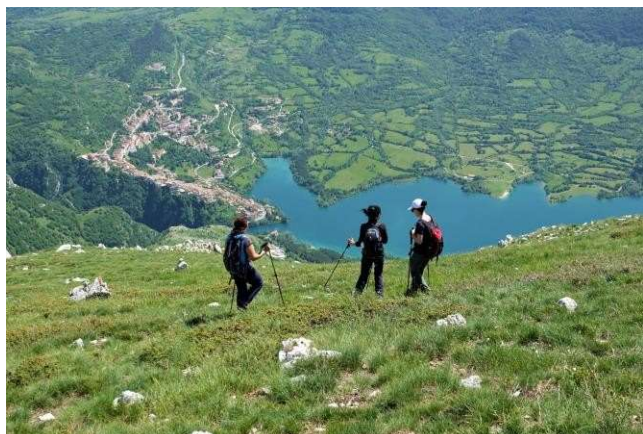
Lake of Barrea, ALMNP