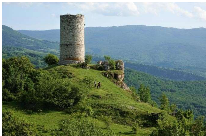
Sperone, hamlet of Gioia dei Marsi