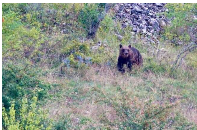
Marsican brown bear