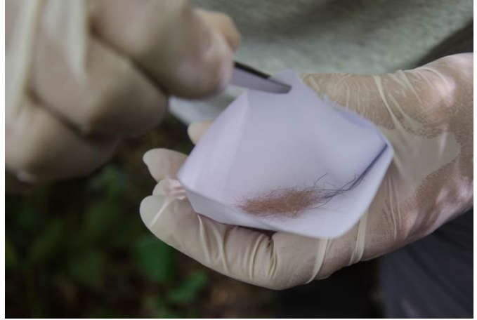
Collection of signs of presence.