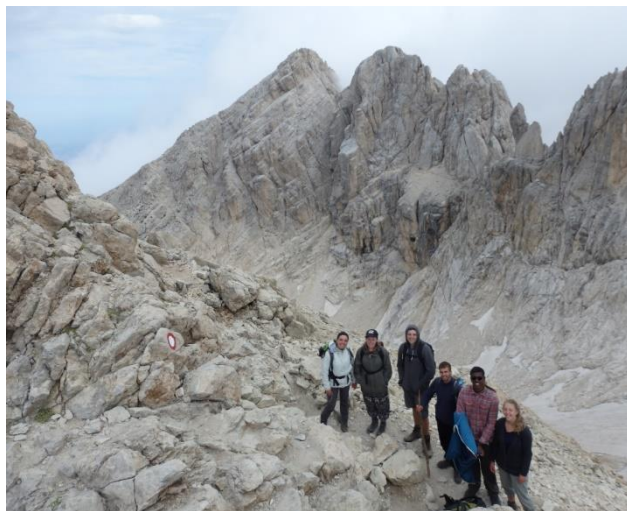
Gran Sasso National Park.