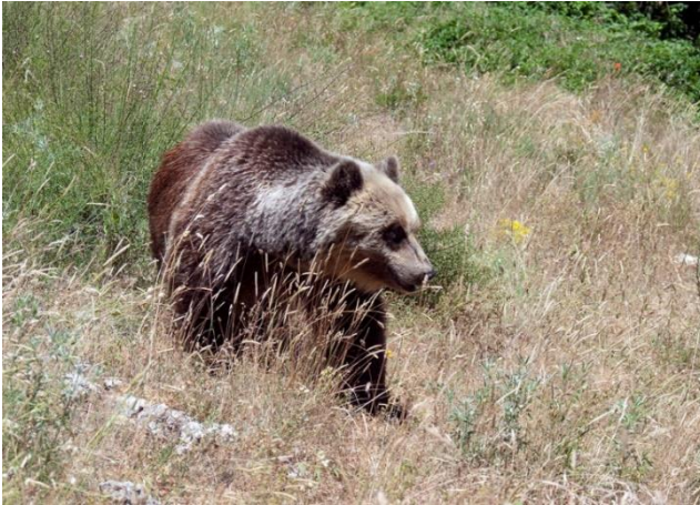
Marsican brown bear.