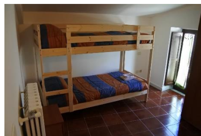
Guesthouse in Rua Frisciotta 2, 67034, Pettorano sul Gizio (AQ), Italy.