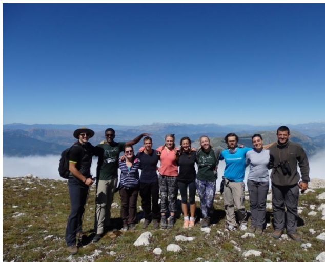
Majella National Park.