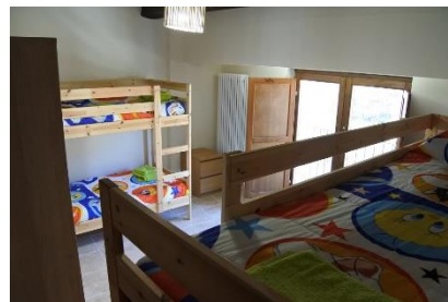
Guesthouse "Pajare" in via Scalelle snc, 67034, Pettorano sul Gizio (AQ), Italy.