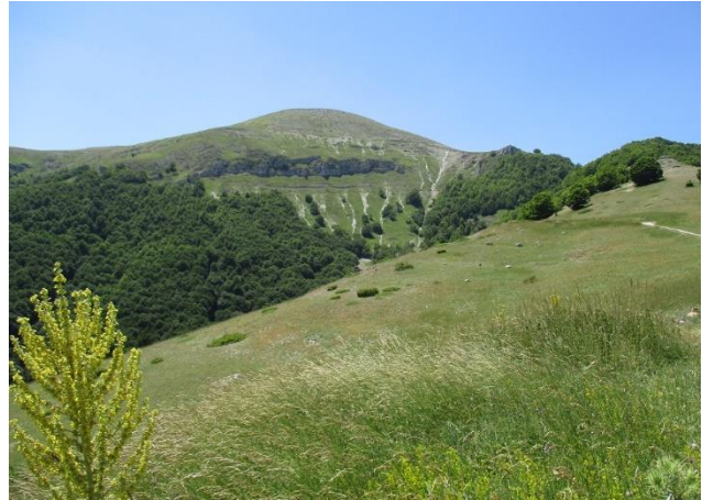
A view of Monte Genzana Nature Reserve.