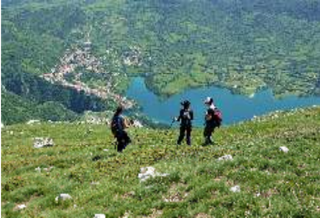
Lake of Barrea, ALMNP