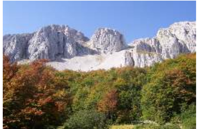
Sirente Velino Regional Park