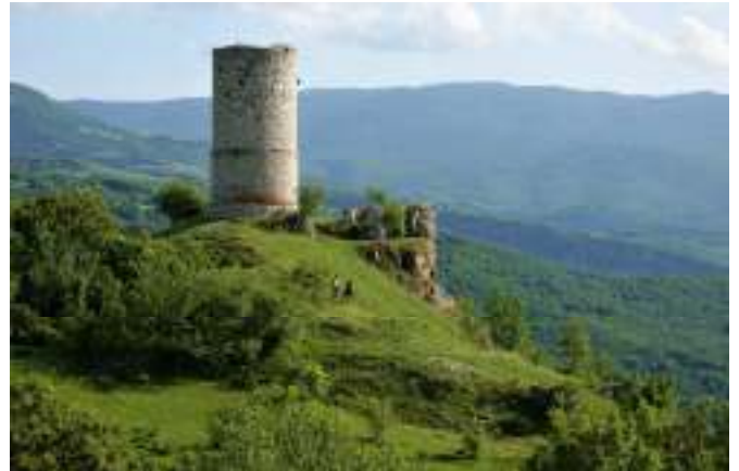
Sperone, hamlet of Gioia dei Marsi