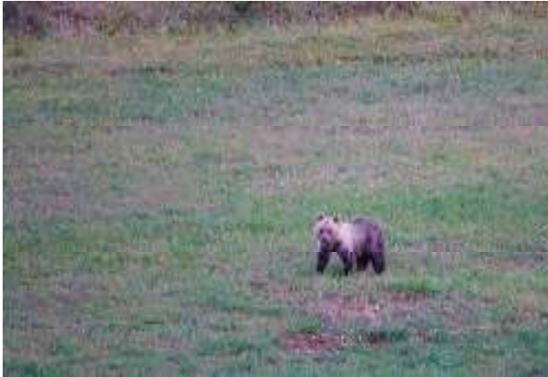
Marsican brown bear