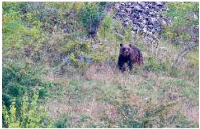
Marsican brown bear