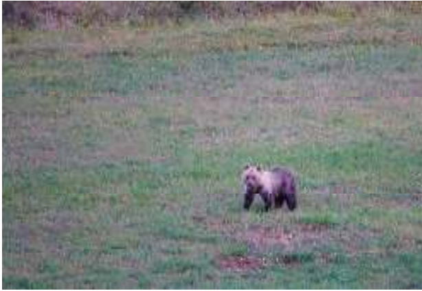
Marsican brown bear