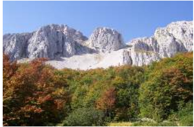
Sirente Velino Regional Park