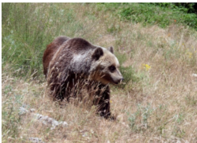
Marsican brown bear.