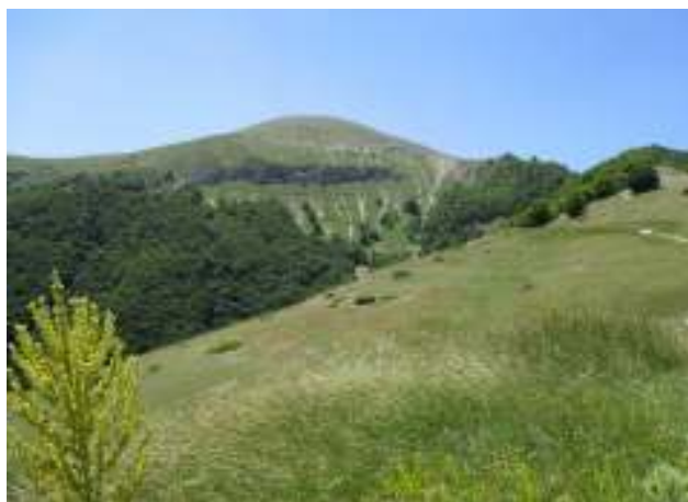
A view of Monte Genzana Nature Reserve.