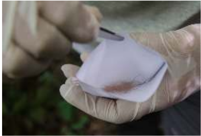
Collection of signs of presence.