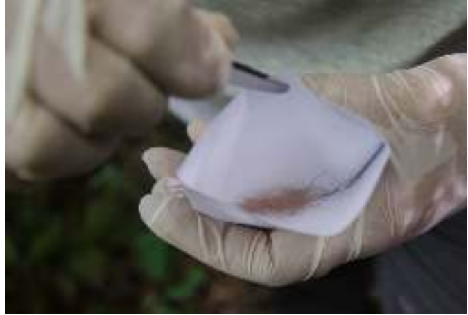
Collection of signs of presence.