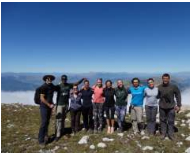
Majella National Park.