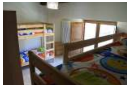
Guesthouse "Pajare" in via Scalette snc, 67034, Pettorano sul Gizio (AQ), Italy.