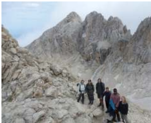
Gran Sasso National Park.