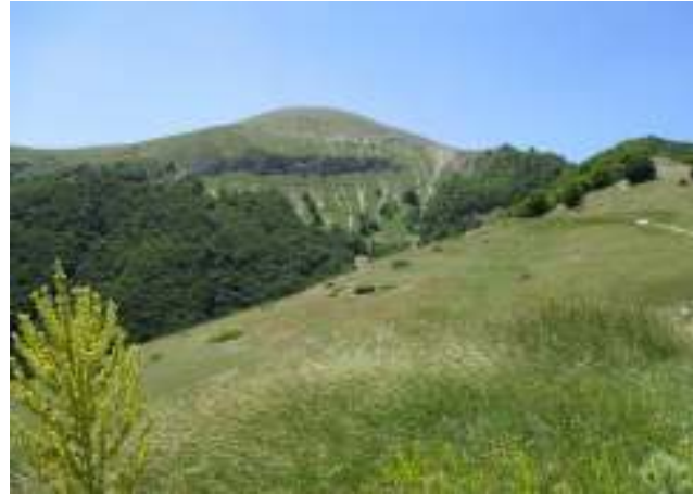
A view of Monte Genzana Nature Reserve.