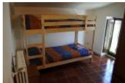
Guesthouse in Rua Frisciotta 2, 67034, Pettorano sul Gizio (AQ), Italy.