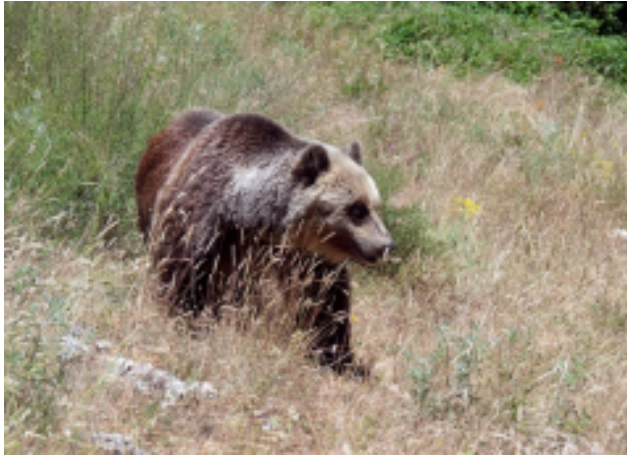
Marsican brown bear.